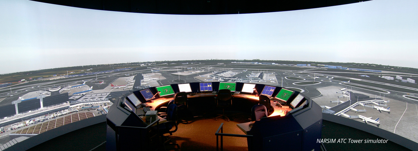
NARSIM ATC Tower simulator