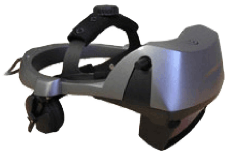
Head-mounted-display for research into augmented reality in ATC Tower environment

A third application area is related to the problem introduced by an increased number of remote camera video feeds. These video feeds all need video displays set up in the ATC Tower environment, potentially blocking important line-of-sights or in other ways obscuring the outside view. Providing the camera feeds on a Head-Mounted-Display (HMD) or a similar device could potentially solve this problem.